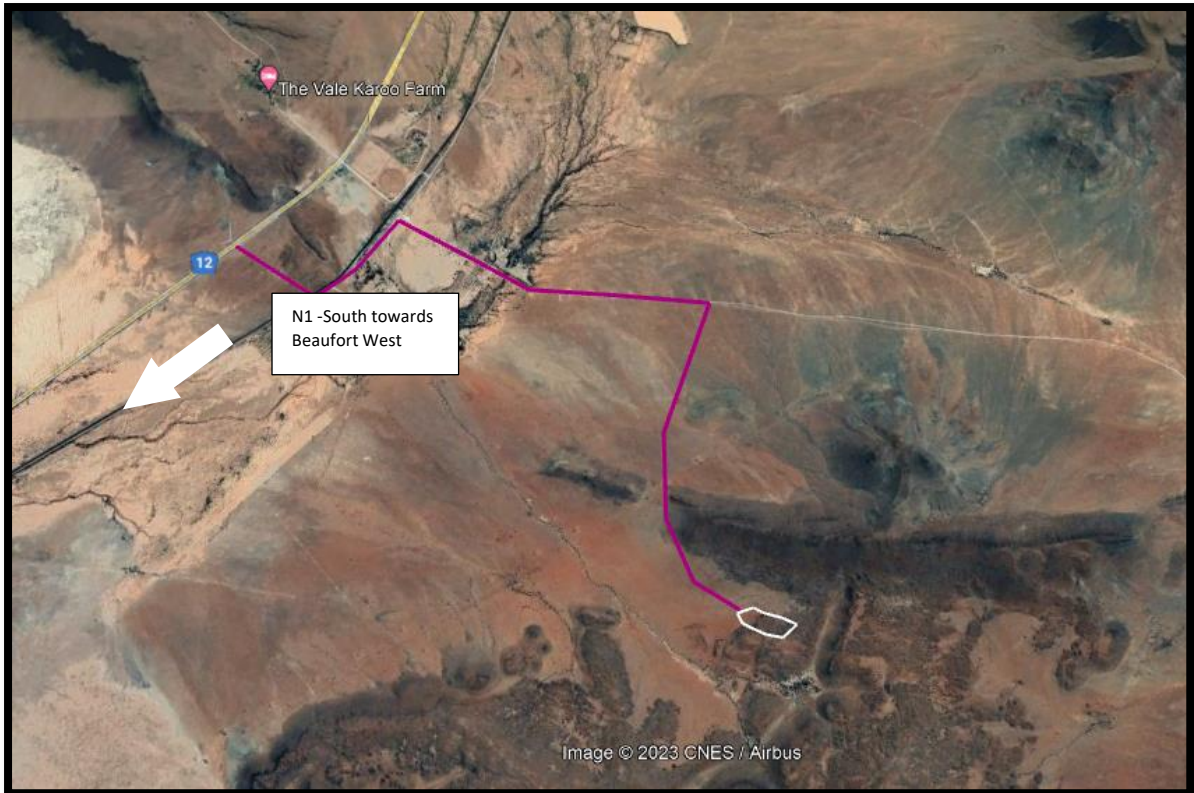
Figure 1: Satellite view of the proposed mining permit area (white polygon) of Otter Mist Trading 1057 (Pty) Ltd

A total of 33 alien plant species have been recorded within the extracted area, with 9 of them being listed invasive species within the NEM:BA A&IS Regulations, namely: